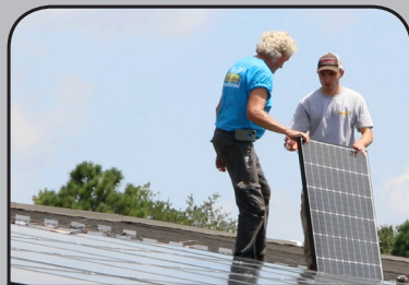
Solar panel installation at the Streets & Drainage facility.

According to Saunders, 80% of all new residential rooftop solar installations in Georgia last year occurred in Athens.