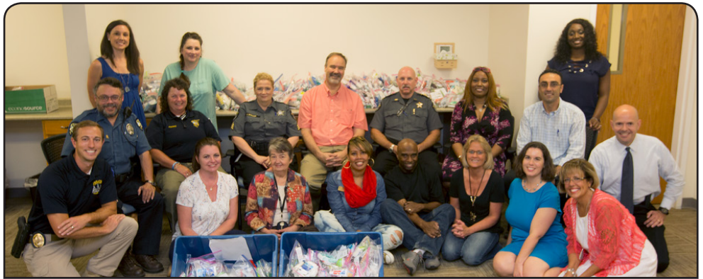
The fall 2017 Management Skills Training class and volunteers from the Police Department assembled over 500 personal care kits on August 9 from donations.